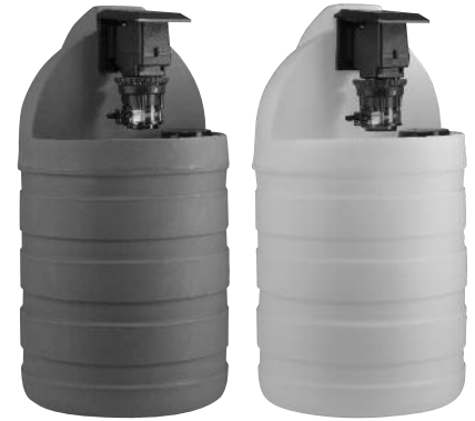
30-Gallon (113.6 Liters)