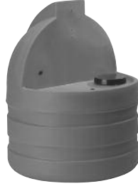
15-Gallon (56.8 Liters)