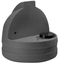
7.5-Gallon (28.4 Liters)