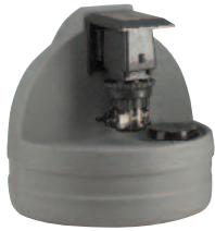
7.5-Gallon (28.4 Liters)