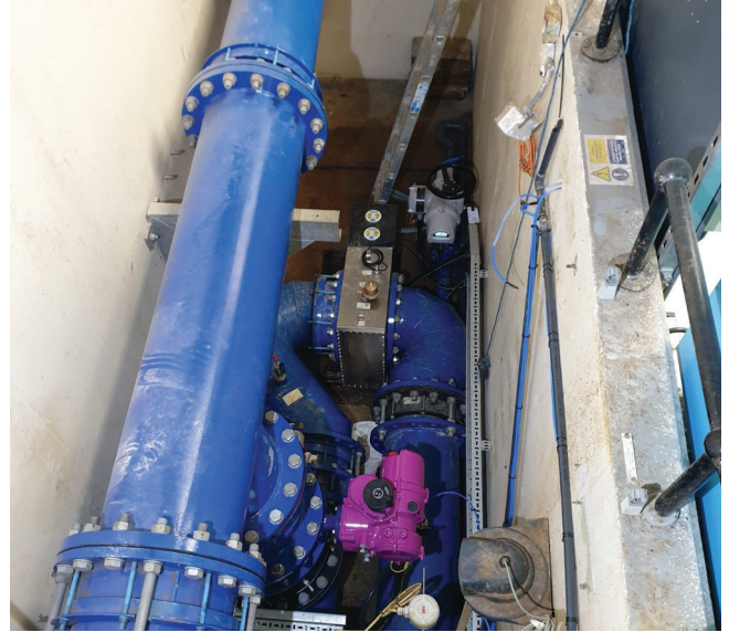
Mosswood filter after Wafer UV system installation

In addition, Evoqua customer data has shown that this approach to UV is able, based on bespoke validation, to provide a higher log reduction than originally needed, allowing sites to provide a higher log reduction or increase flow at current log reduction. This supports the futureproofing of a plant's water supply.