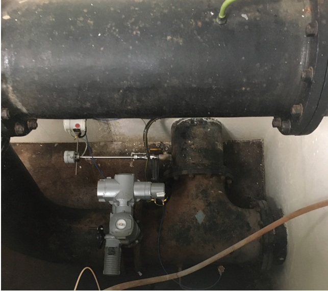
Mosswood filter before Wafer UV system installation