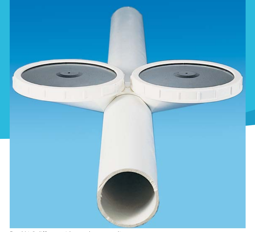
DualAir® diffuser with membrane media.

The EPDM membrane media is a high pressure injection molded compound using a well proven formula that has superior rebound memory. It will last up to 10 years, even at high airflow rates. The membrane includes precision perforated "I" slits that resist tearing and stay cleaner, longer. They open when airflow is present, close when airflow is stopped. A thick center prevents ballooning and the unique tapered membrane cross section guarantees equal fine bubble distribution across the entire surface. When ceramic media is supplied it meets or exceeds all industry standards for strength and performance.