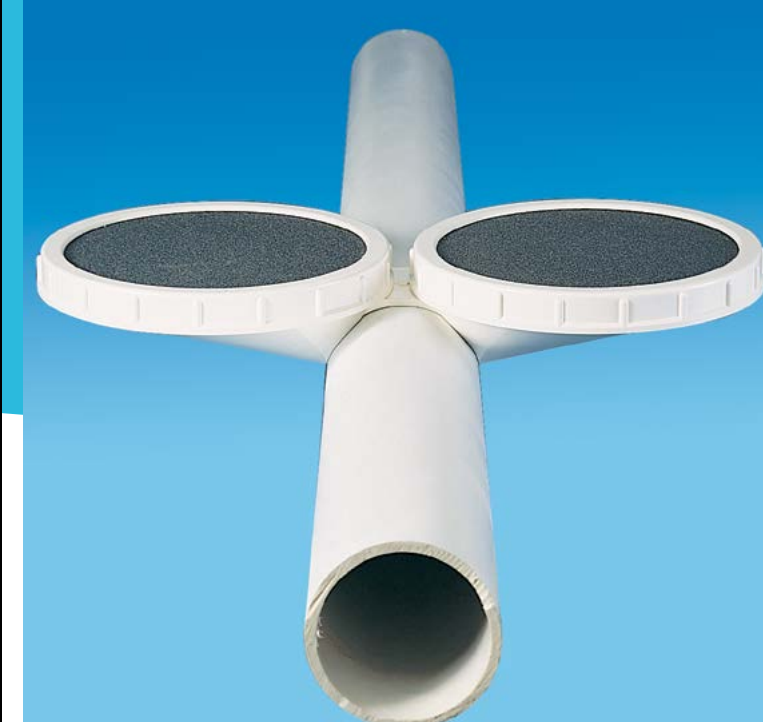
DualAir® diffuser with ceramic media.