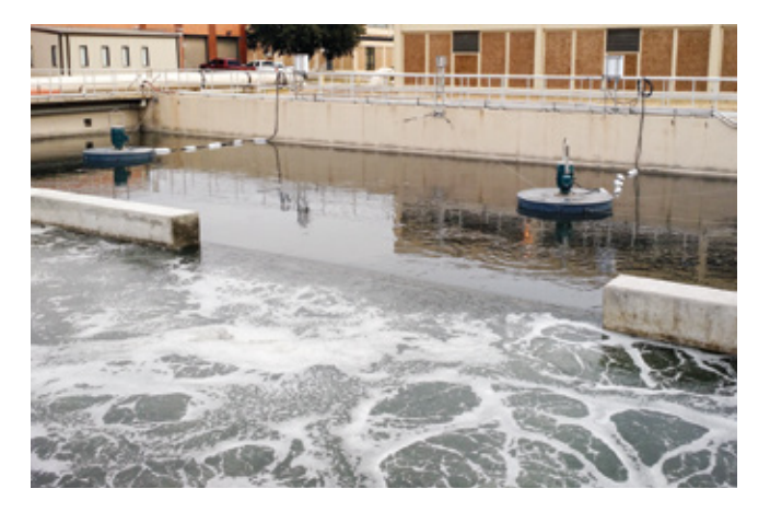
Aqua-Lator<sup>®</sup> Direct Drive Mixers are an ideal solution for anaerobic and anoxic tank mixing in wastewater treatment applications.

Submersible mixers are currently the more prevalent of the two designs. They can be mounted on a wall bracket with a hoist to be raised for service. Submersibles are typically low-speed mixers with an integral gearbox and motor assembly.