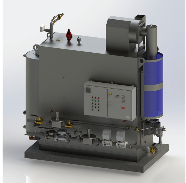
Envirex stand-alone boiler with cast iron construction for long life