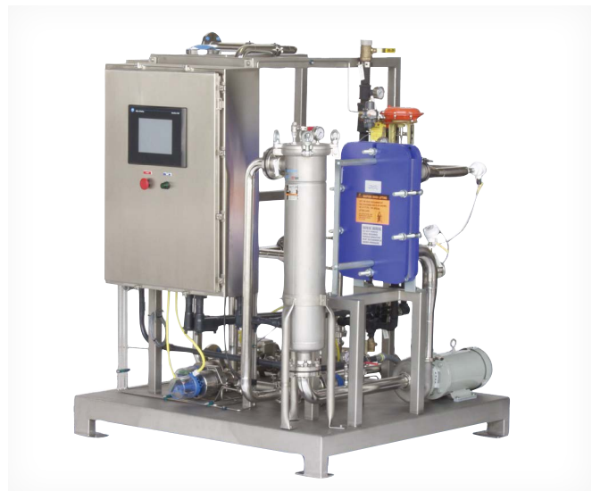
The 150 gpm HOT Series System is capable of operating in conjunction with one to three carbon towers.

Finally, a short rinse cycle (filter to waste) is used to resettle the bed and displace the backwash water. The system can now be placed on-line with assurance of a near zero bacteria count.