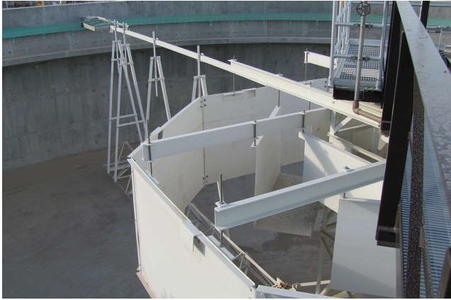
FEDWA baffle system improves flocculation for more efficient solids settling.