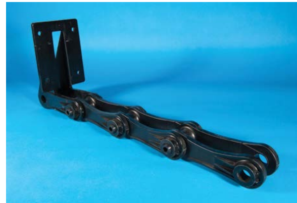
Collector Chain NCS720S - The worldwide standard for molded chain

Trust the inventors of non-metallic components