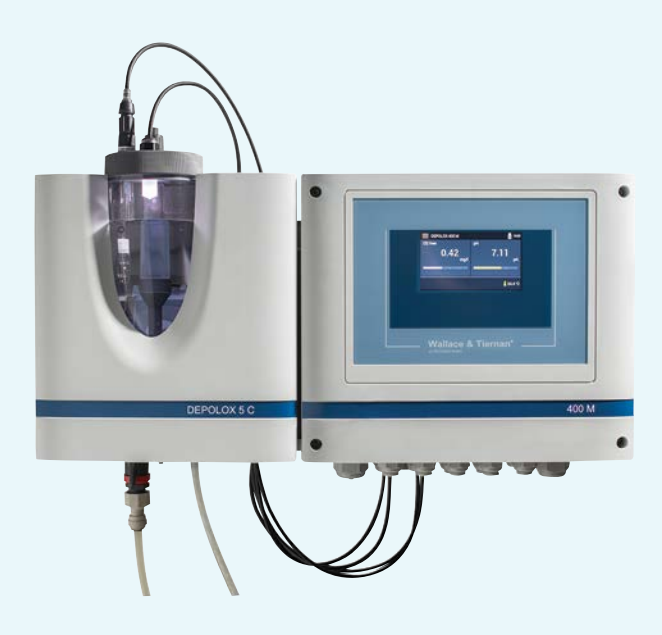
DEPOLOX® 400 M ANALYSER

Helping you respond to changes in the environment and to control the spread of diseases, Evoqua's solutions enable the management of disinfection process parameters assuring compliance with health, safety and regulatory standards, providing peace of mind for aquaculture producers.