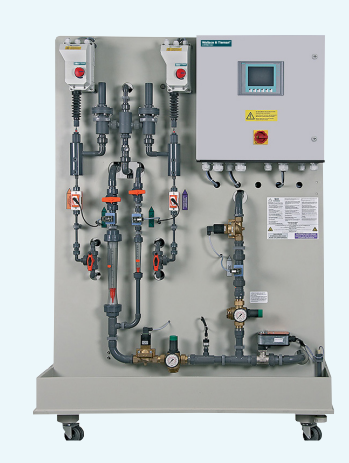
DIOX-A CHLORINE DIOXIDE GENERATOR

Chlorine dioxide generation can be based on two methods: Acid-Chlorite and Chlorine-Chlorite. In both instances, chlorine dioxide is produced as an aqueous solution with a constant strength. For the Acid- chlorite method Hydrochloric acid (HCl) and Sodium Chlorite (NaClO2) are used, and for the Chlorine-Chlorite method Sodium Chlorite (24.5% NaClO2) and Chlorine (Cl2) gas are used. The optimal ratio of the two chemicals ensures maximum yield of chlorine dioxide.