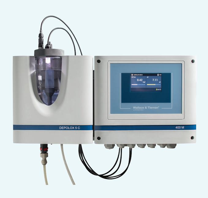
DEPOLOX® 400 M ANALYSER

of water quality parameters to ensure health, safety, and regulatory compliance. The fast and reliable systems balance the required chemicals, ensuring safe, cost-effective process water.