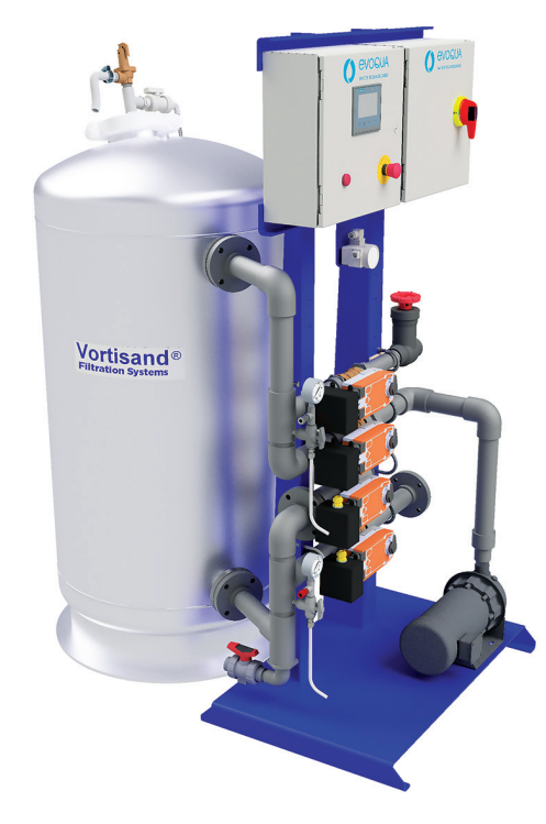
VORTISAND® SYSTEM C-SERIES

The VAF automatic self-cleaning screen filters can remove suspended solids from 1500 to 10 micron. The patented bidirectional drive design does not require electric motors, limit switches, gearboxes, or hydraulic pistons, thereby eliminating external shafts and seals.