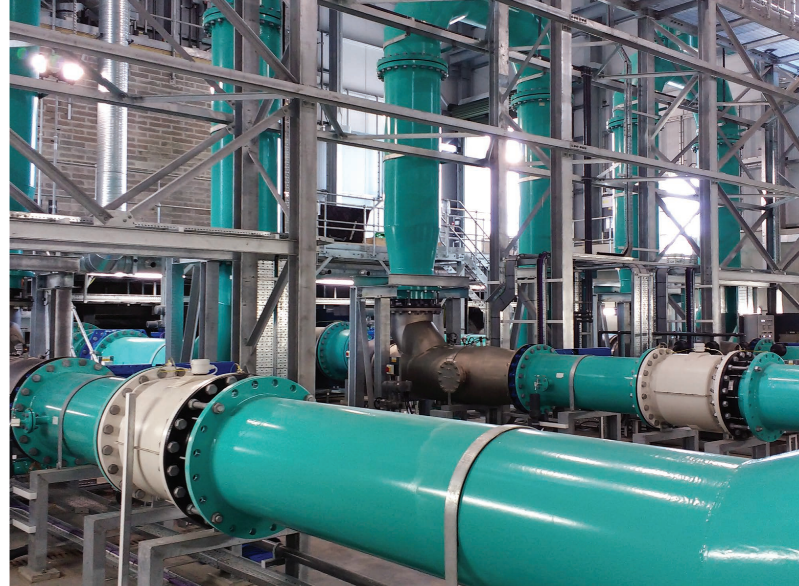
UVLX-30800-30 low pressure amalgam system in situ operating at a UK drinking water plant