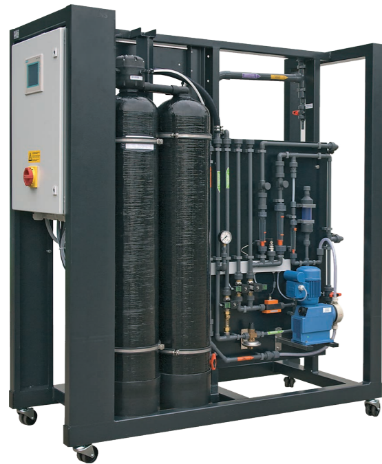
OSEC B-PAK System