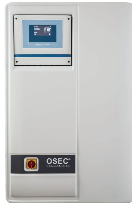
OSEC L System