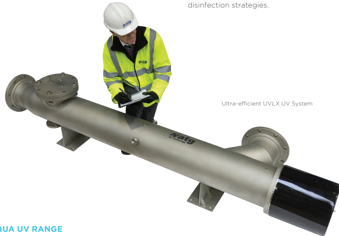
Ultra-efficient UVLX UV System

Ultraviolet disinfection works by using short wave UVC light between 200–315 nanometres. UVC light at this wavelength is absorbed by the DNA of microorganisms and efficiently disinfects any fluid passing through the system. Validated by extensive testing for reliable performance, Evoqua have invested heavily to support water companies on the application of UV into disinfection strategies.