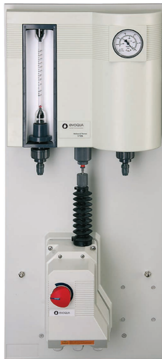
V10K™ Vacuum Gas Feed System

Gas Chlorination is one of the most economic disinfectants available as gaseous or liquid chlorine supplied in cylinders or ton containers. Using a remote vacuum operated gas feeder, a chlorine solution is prepared on site from chlorine gas and water. Evoqua offers the V10K™ vacuum gas feeder featuring the proven V-notch flow control technology for safe and accurate dosing and control of gaseous chlorine, including other disinfectants such as ammonia and sulphur dioxide.