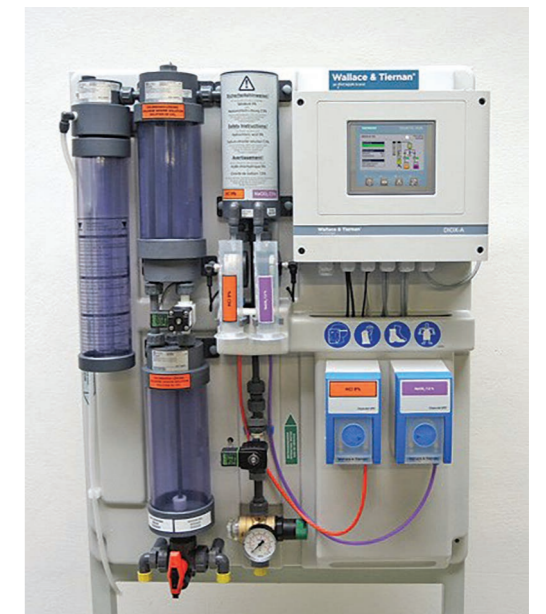
DIOX-A Chlorine Dioxide Generator

Evoqua's DIOX range produce a high quality, chlorine dioxide solution that will improve efficiencies and drastically reduce the chance of a bacterial outbreak. Effective as both a disinfectant and oxidizing agent, it is also ideal for the control of biofilm and zebra mussel control within inlet systems.