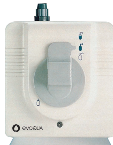
S10K™ Vacuum Regulator