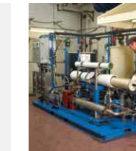
Membrane Care<sup>SM</sup> Program